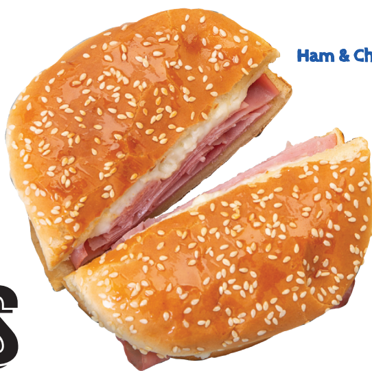
Ham & Cheese